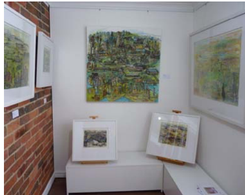
Walls are 2200 high

Hanging tracks are installed, hooks, wires, plus labels are supplied. Available plinths can be repositioned. Power can be used to run a dvd on a small tv, or music or projecting device. A shade can be fitted to the ceiling bulb. The window sill can be used for standing frames and the curtain decorated with removable, lightweight objects. Consideration will be given to creating an 'atmosphere' different from the rest of the gallery, within safety restrictions – no water, fumes or loud sounds. The floor is particle board.