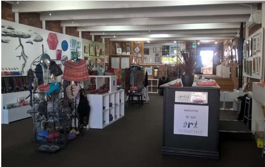
The light filled space is the focal point of the upper level with direct connection to the front door used in Art on Piper promotional imagery.

CONTACT Deborah 0411 530 015, Kathryn 0407 887 498, Marianne 0408 351 137