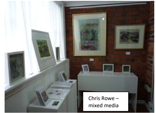
Chris Rowe – mixed media